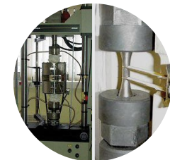
Thermo-mechanical fatigue machine