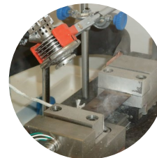
Hot corrosion SCR bench