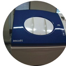
Climatic corrosion chamber