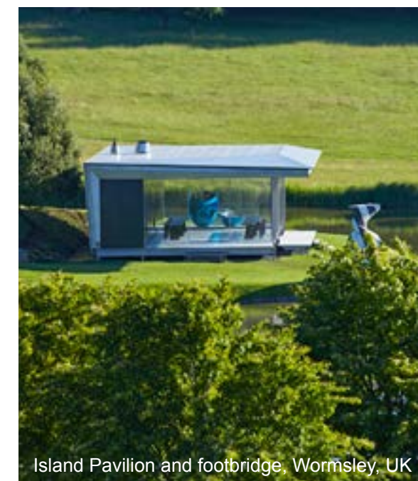
Island Pavilion and footbridge, Wormsley, UK

Aperam's sustainability reports are issued on a yearly basis and are available on Aperam's website, www.aperam.com in the Sustainability section. Next release will be organised ahead of the 2016 Annual General Meeting.