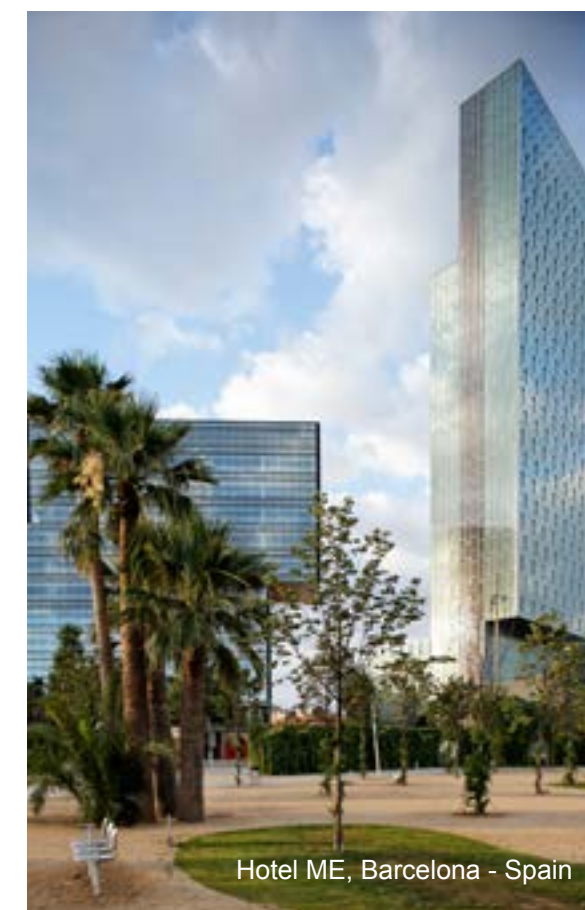
Hotel ME, Barcelona - Spain

The Remuneration, Nomination and Corporate Governance Committee oversees directors training and development. This approach allows induction and learning opportunities to be tailored to the directors' committee memberships, as well as the Board's specific areas of focus. In addition, this approach ensures a coordinated process in relation to succession planning, Board renewal, training, development and committee composition, all of which are relevant to the Remuneration, Nomination and Corporate Governance Committee role in securing the supply of talent to the Board.