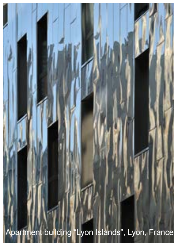
Apartment building "Lyon Islands", Lyon, France

Overall in 2016 the Group will remain cautious on capital expenditures whilst allowing adjustments based upon market conditions.