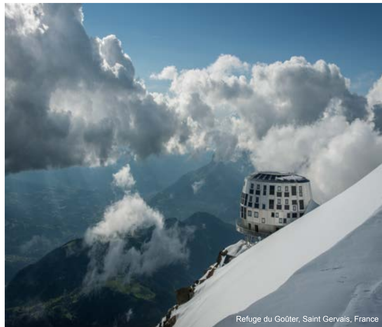
Refuge du Goûter, Saint Gervais, France