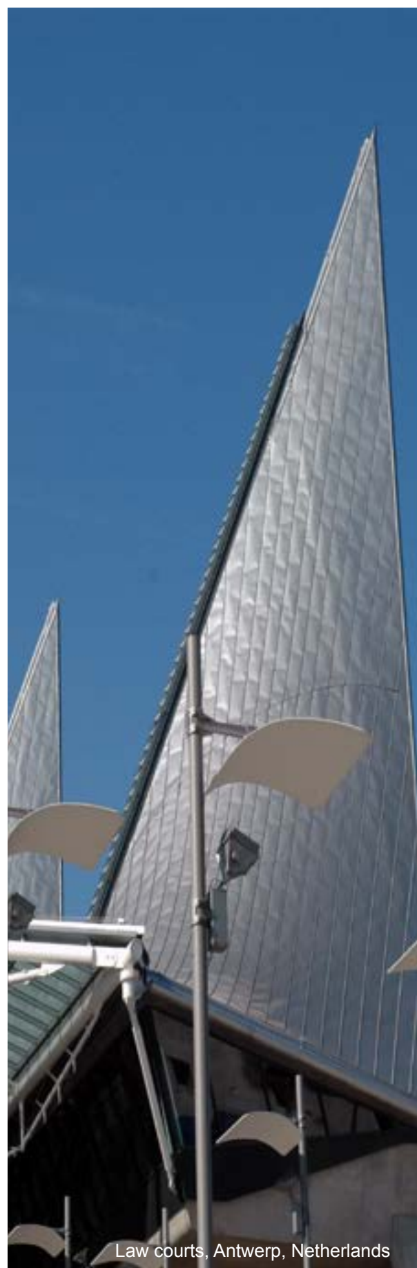
Law courts, Antwerp, Netherlands

In accordance with the Luxembourg Stock Exchange's 10 Principles of Corporate Governance, non-executive members of Aperam's Board of Directors do not receive share options, RSUs or PSUs.