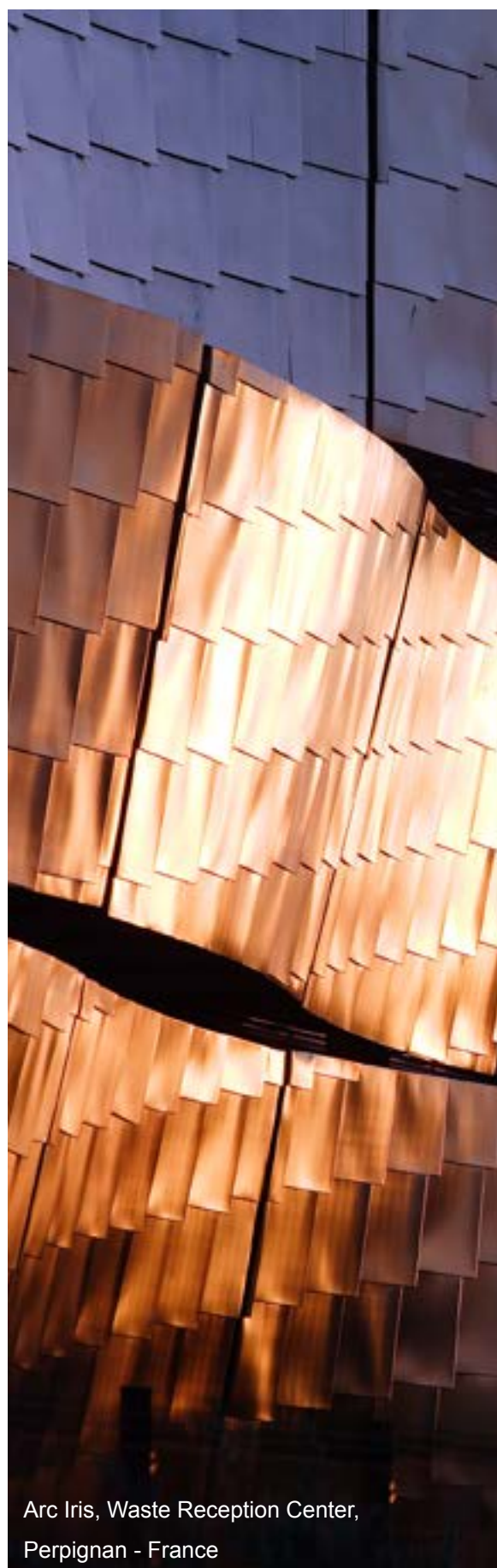
Arc Iris, Waste Reception Center, Perpignan - France

The full year and fourth quarter 2015 results press release including the outlook section is available on www.aperam.com under Investors & Shareholders, Earnings.