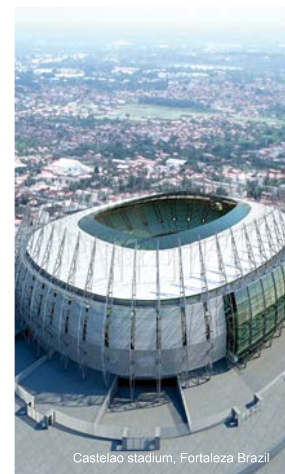
Castelao stadium, Fortaleza Brazil

Equity attributable to the equity holders of the parent decreased to $2,217 million at December 31, 2015, as compared to $2,672 million at December 31, 2014, primarily due to foreign currency translation differences of $601million, partly offset by net income for the year of $172 million.